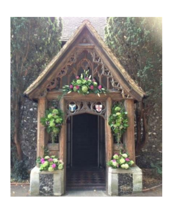
Full North Porch arrangement examples