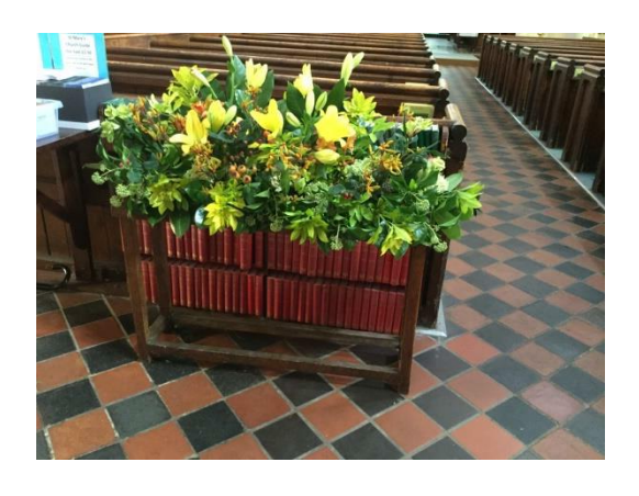
Close up of long stand arrangement

For further information please email the Flower Team at office@stmarysmerton.org.uk